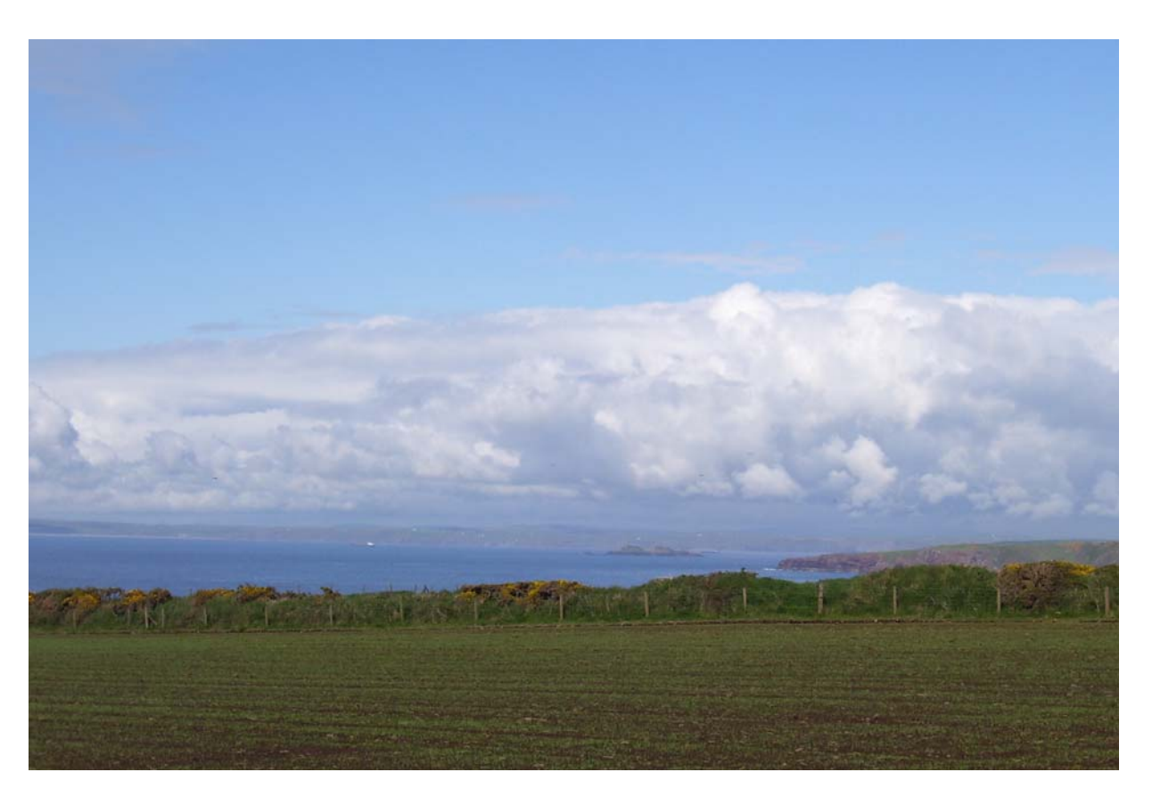
West of Wales Shoreline Management Plan 2 Cardigan Bay and Ynys Enlli to the Great Orme Coastal Group

Section 6 Summary and Comparison of Policy