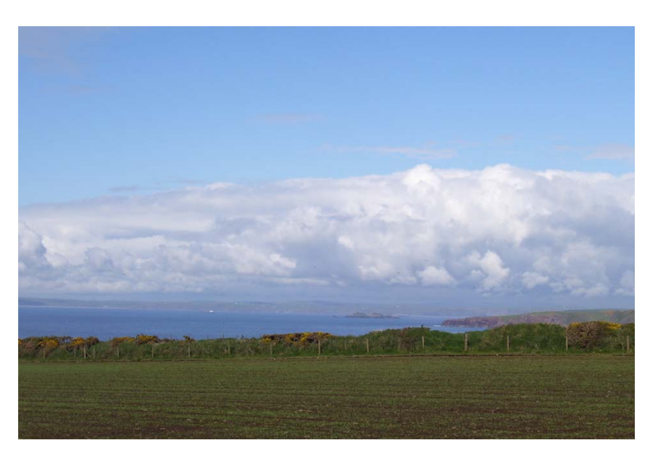
West of Wales Shoreline Management Plan 2 Cardigan Bay and Ynys Enlli to the Great Orme Coastal Group